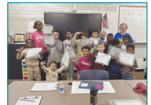
Children receive certificates Good News Club, Berlin Community School